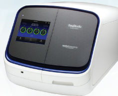
SeqStudio™ Genetic Analyzer