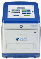
AZURE CIELO™ REAL-TIME PCR