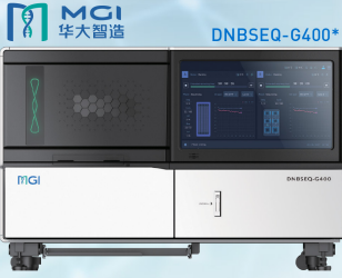
Comprehensive and Flexible Genome Sequencer