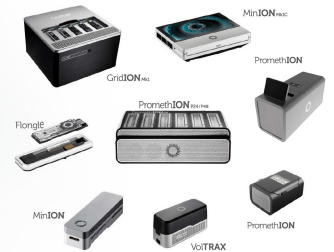
Biology for anyone, anywhere