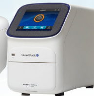
QuantStudio™ 5 Real-Time PCR System