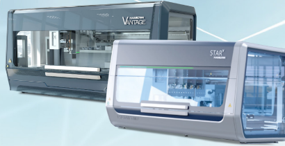
Hamilton Microlab VANTAGE Liquid Handling System Hamilton Microlab STARV