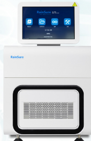
Sample Prep Station