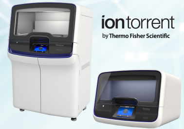
Ion Torrent™ Genexus™ System A new day for your lab, A new world of NGS